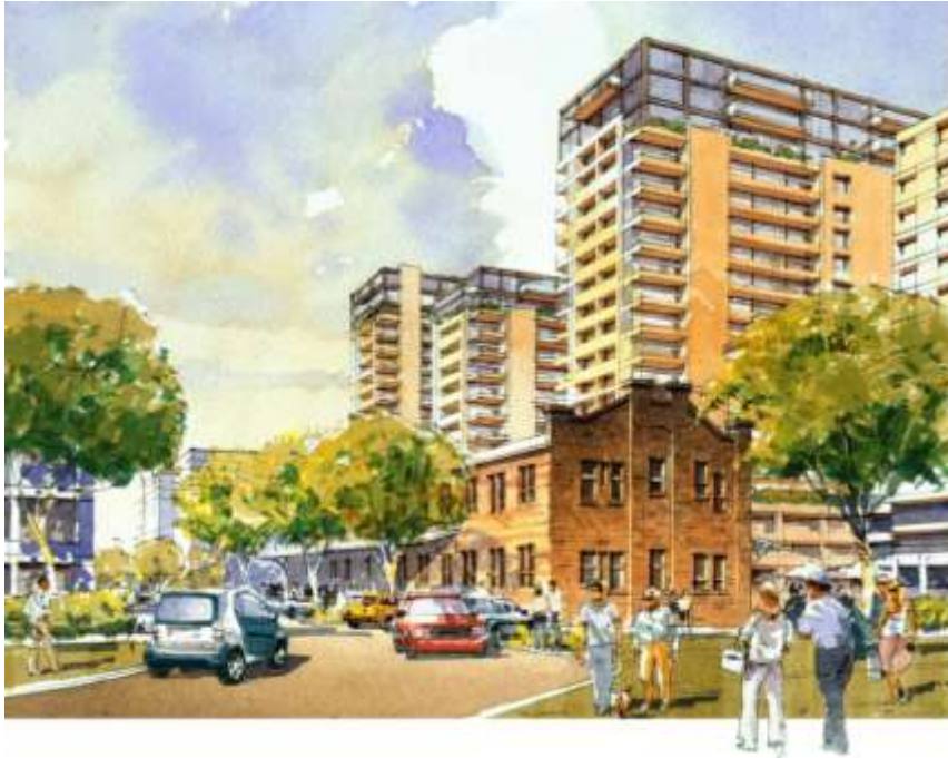
Illustration for discussion -the challenge of balancing all of the key moves and design principles by using a local example.