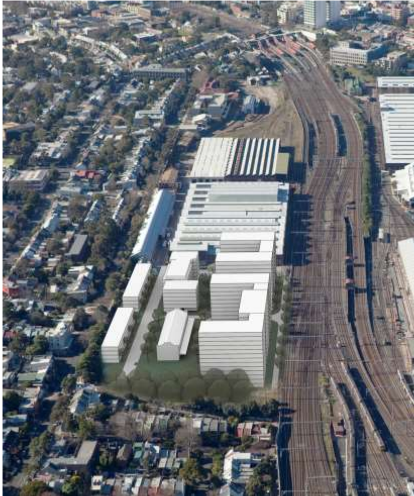
Illustration for discussion -the challenge of balancing all of the key moves and design principles by using a local example