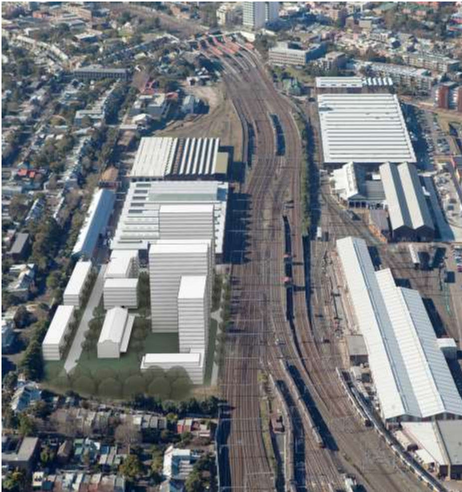
Illustration for discussion -the challenge of balancing all of the key moves and design principles by using a local example